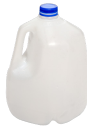
Plastic Milk Jug