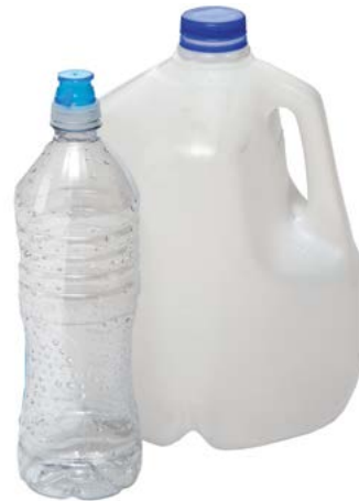
Plastic Bottles & Jugs