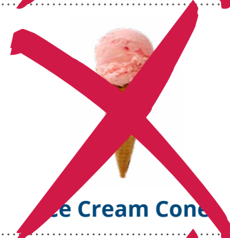
Ice Cream Cone