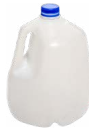
Plastic Milk Jug